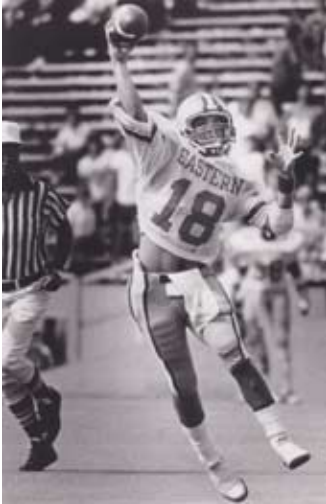
QB Sean Payton (1983-86) holds virtually every EIU passing record as he directed the 1986 Panthers to the NCAA I-AA quarterfinals.