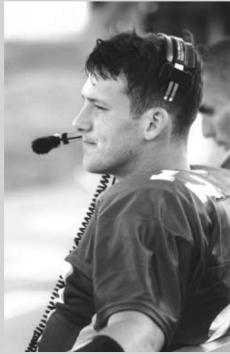
All-American quarterback Tony Romo (1999-2002) was selected as the 2002 'Walter Payton Trophy' winner as the best player in NCAA I-AA football.