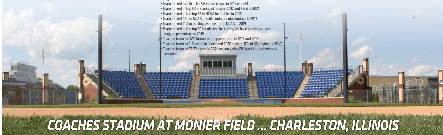
COACHES STADIUM AT MONIER FIELD ... CHARLESTON, ILLINOIS